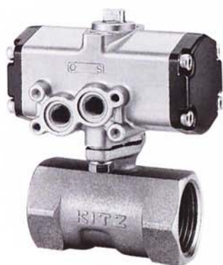
Fig. C-UTE Reduced Bore