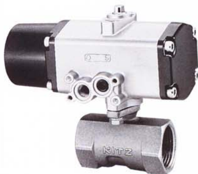
Fig. CS-UTE Reduced Bore